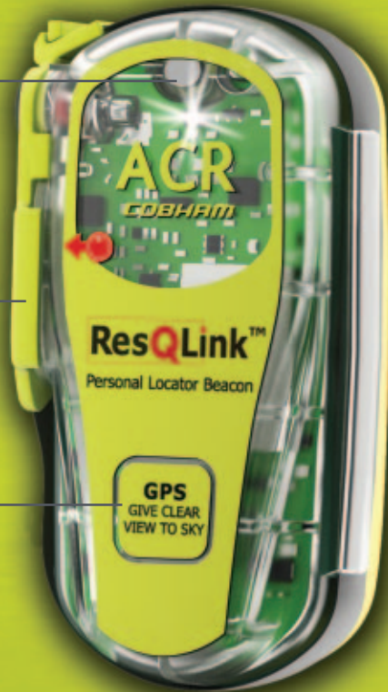
Product shown actual size 3.9"